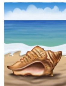
Mission by the Sea